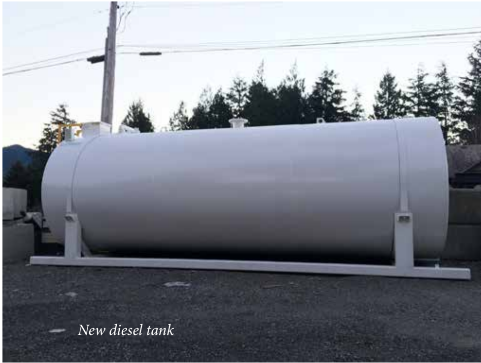
New diesel tank