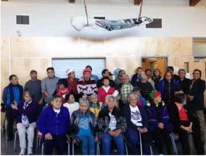
Group photo of Elders