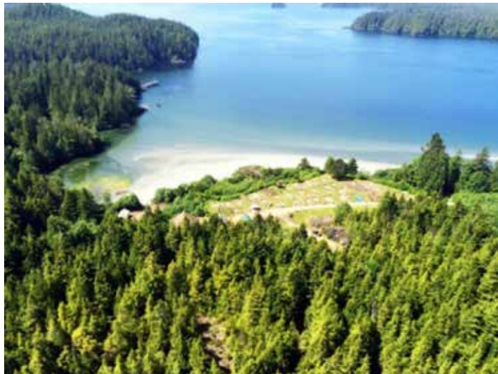
Aerial shot of Maasquiaht (Lone Cone Hostel and Campground)

will be developed by former students, Ahousaht and other First Nation elders and youth and will transform the content into interpretive and interactive, educational and artistic exhibits that can be enjoyed and understood by people from many diverse backgrounds. The storyline weaved will illustrate pre-and post-contact interactions and historical milestones culminating with the expression of unity and hope that marks the celebration of Canada's 150th birthday. Public celebrations will be hosted to open the site and cultural displays will be held on a regular basis to enhance the displays. Youth learning events will be hosted on a regular basis. Plus, one heck of a firework display will occur on July 1st 2017 everyone is invited to attend the celebrations!