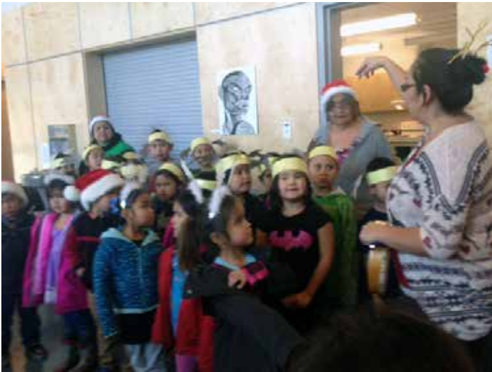
Kindergartens, Grade 1 and 3's shared some of their Christmas Cheer

This year's Elders Christmas Lunch was awesome! The school's multipurpose room was abuzz with Christmas merriment. There was an incredible turn out of our Elders who left the luncheon with bellies full and with a contented sense of happiness. The best way to spread Christmas cheer is by signing loud for all to hear and this year's Elders luncheon entertainment knocked it out of the park! The performers this year were the kindergartens, grade ones and three class who did a spectacular job of putting smiles on the Elders faces. We had some of our Chiefs hand out fish, oranges and chocolates to our honoured Elders. Our Elders truly enjoyed themselves. So, thank you to all of those who helped out in pulling off this very golly Merry Christmas luncheon. We were also able to send smoked salmon out to all Ahousaht elders this year and were so lucky to have been able to put some fish away during the summer months for this purpose.