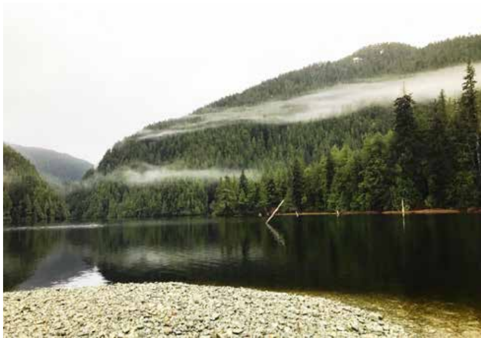
Bulson Lake