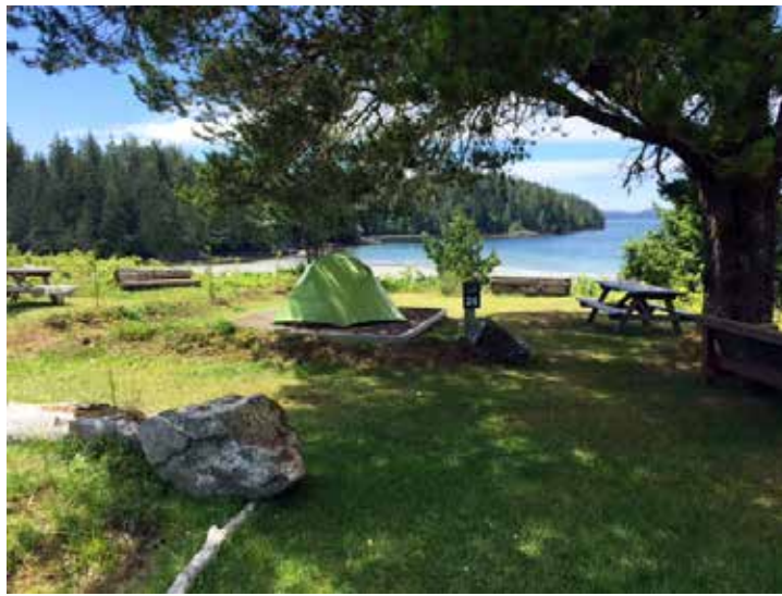
Cultural Tourism and Healing Centre Planned for Matsquiaht Site