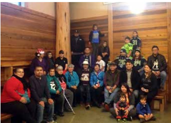
Some of our Ahousaht members living in Seattle who attended a Christmas Luncheon